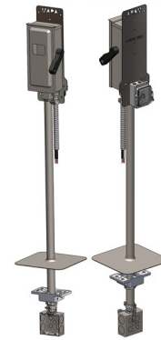
MAPA Rooftop Electrical Pedestal