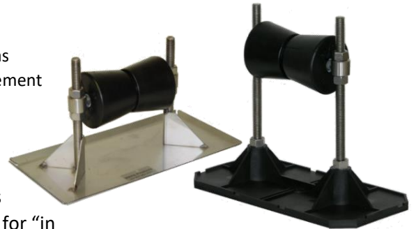
MX-5RA6 & MS-5RA10

The addition of the optional neoprene pad adhered to the base provides additional cushion to the installation surface. All supports are available with optional MWP Series- ½” Walk Pad and adhesive for “in the field” application.